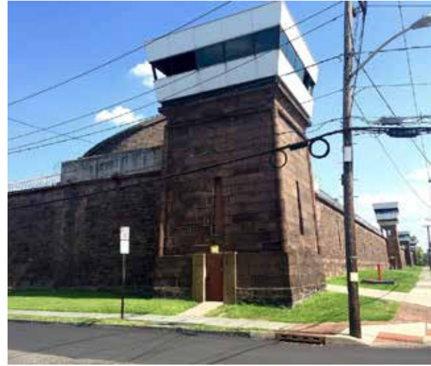
New Jersey State Prison - Trenton, NJ