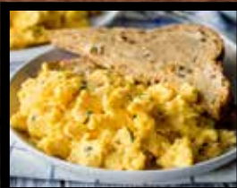
Serving Breakfast at 11am