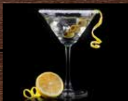
Martini Monday! $5 Wells