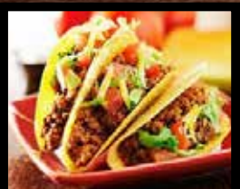
Taco Tuesday! $7.99