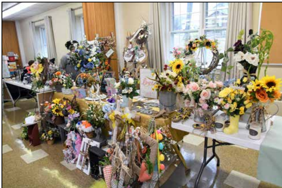
Grace United Methodist Church in Pen Argyl, PA, recently hosted their Annual Spring Craft Show & Bake Sale on March 9th.