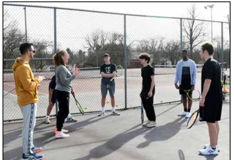
Pen Argyl (left) and Bangor (right) boys tennis teams started conditioning for the 2024 Season on March 8th. Pen Argyl has their first match on March 16th, and Bangor will have their first match March 18th. Good Luck this Season Boys!