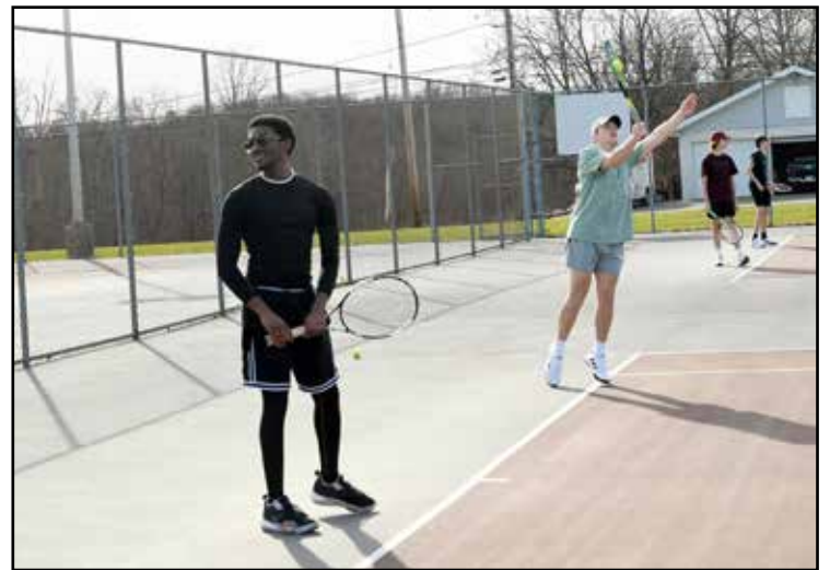
Bangor Boys Tennis (Top), Pen Argyl Boys Tennis (Bottom).