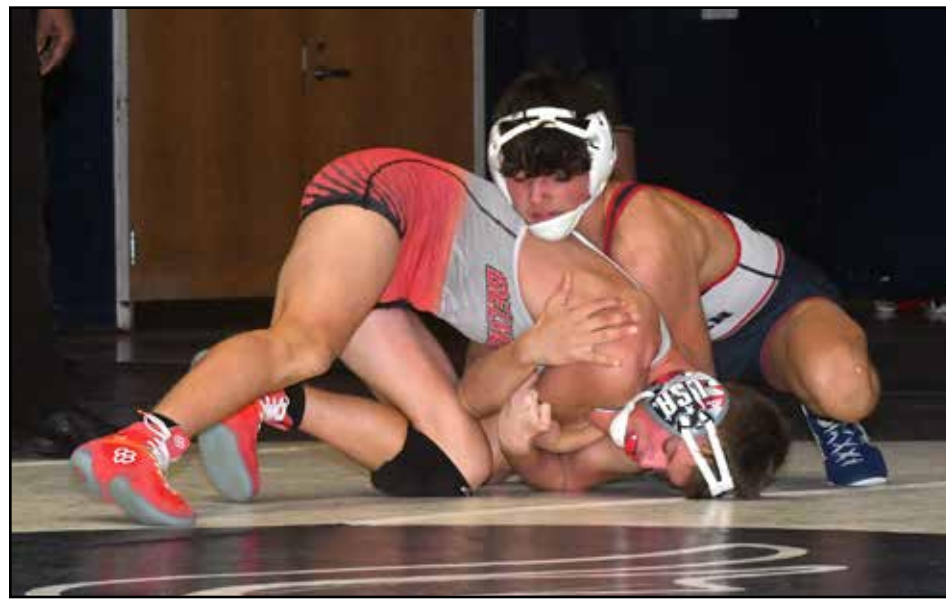
North Warren took on Belvidere High School on January 24th during their Senior Night Wrestling Match. Belvidere won, 45 to 33.