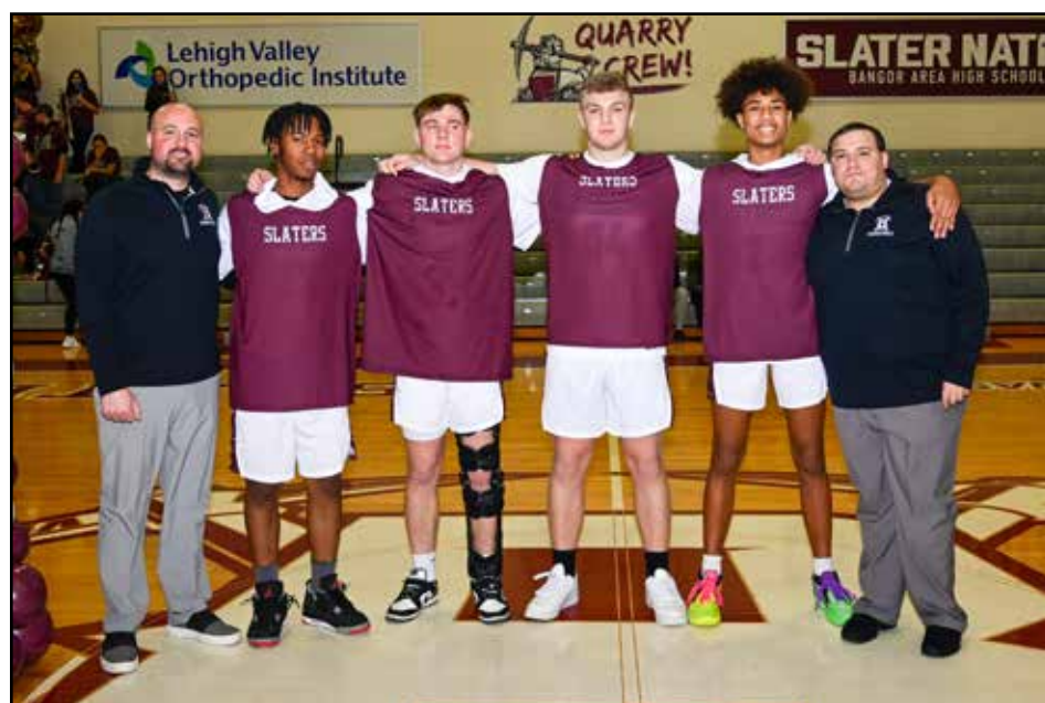
Bangor took on Southern Lehigh during their Senior Night boys basketball game on January 23rd. Bangor won, 60 to 52.