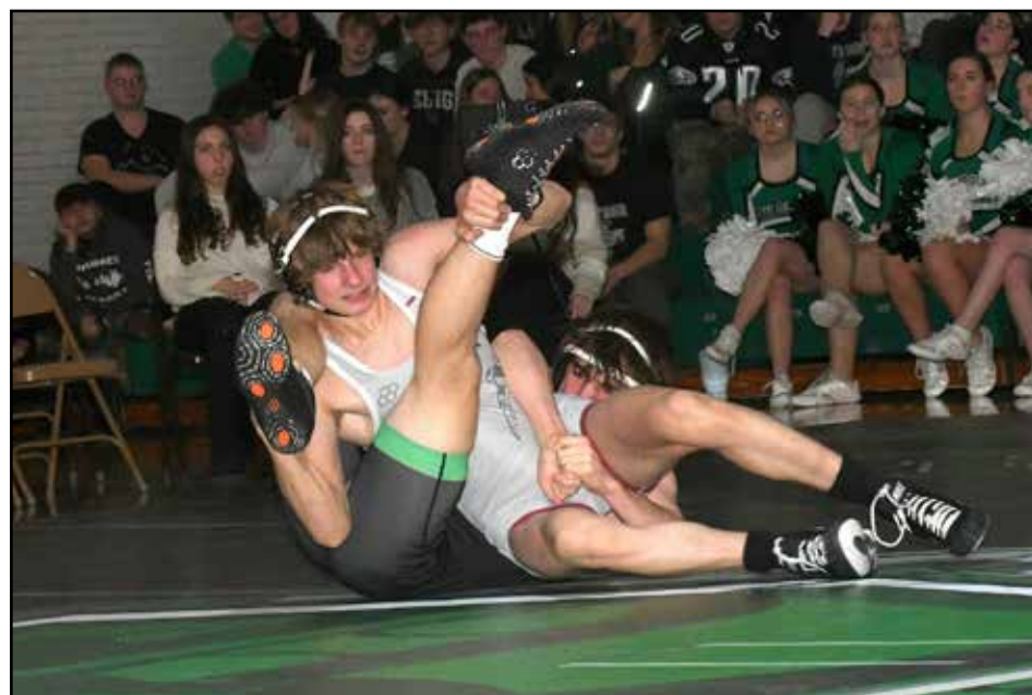
Pen Argyl went head to head against their Slate Belt Rivals, Bangor High School, during their Senior Night wrestling match on January 24th. Bangor was the victor in a close match up, 34 to 31.