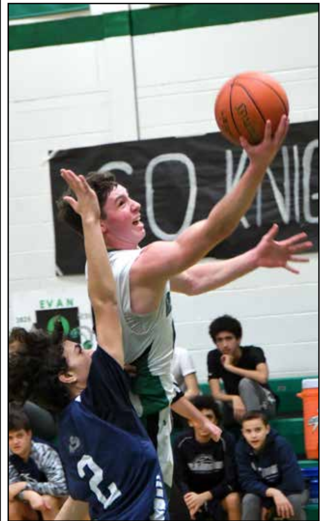
Pen Argyl went head to head against Northern Lehigh during their Senior Night boys basketball on January 25th. Pen Argyl won, 47 to 45.